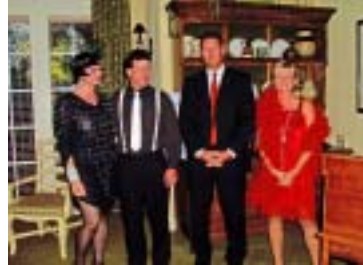
The Cats Meow