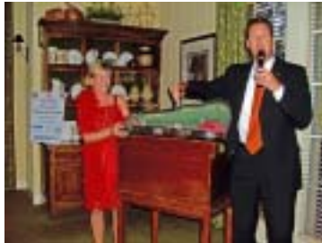
Passing the Gavel