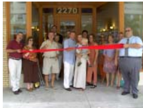
TOP FLORIDA PROPERTIES-- Located at 2270 First Street-- 690-2030