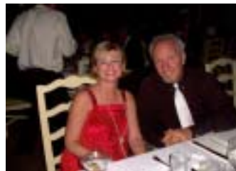
On the Lam