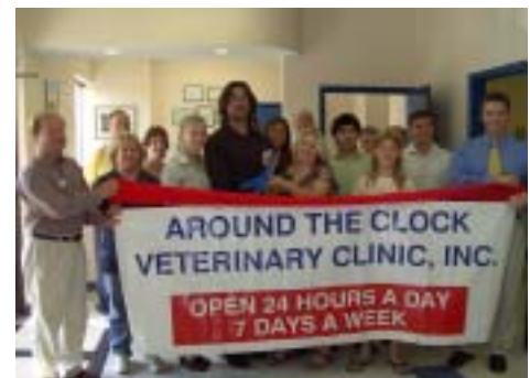
AROUND THE CLOCK VETERINARY CLINIC -Located at 10962 S. Cleveland 274-7387