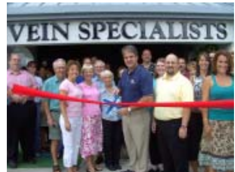
VEIN SPECIALISTS-- Located at 1510 Royal Palm Square Blvd., Ste. 101 694-8346