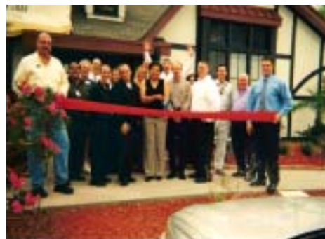
STEAK AND ALE -Located at 12499 Cleveland Avenue 939-3444