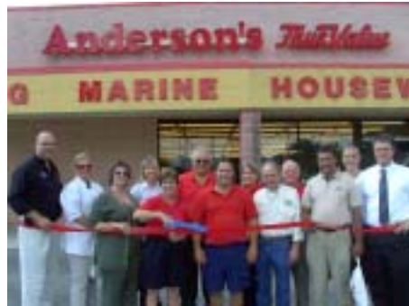
ANDERSON'S TRUE VALUE Located at 8750 Gladiolus Drive 332-7400