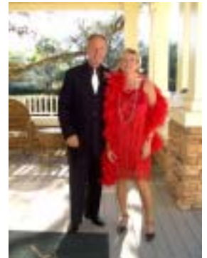
Puttin’ on the Ritz