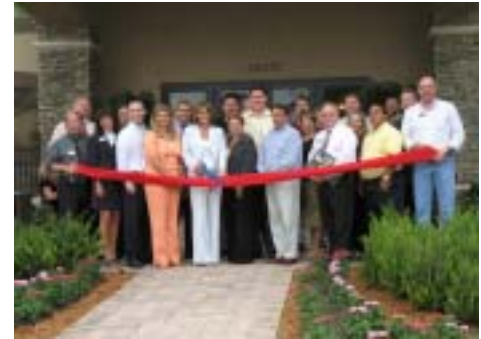
GL HOMES Located at 10312 Longleaf Pine Ct.. 694-7021