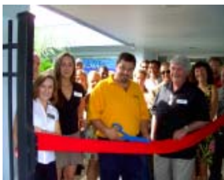
Ares Lending - Located at 2180 Maravilla Lane. 935-0341