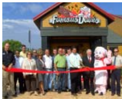
Famous Dave's - Located at 12148 S. Cleveland Ave. 997-1997