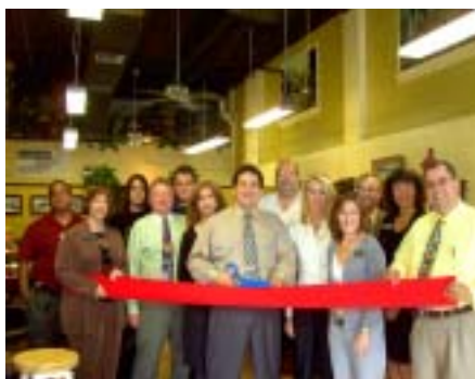
Peoples Mortgage - Located at 1617 Hendry Street. Suite 102.