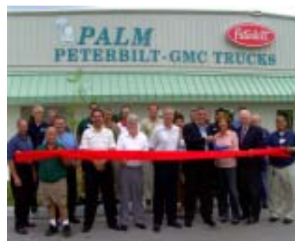
Palm Peterbuilt-GMC Trucks - Located at 5313 Dr. Martin Luther King Jr. Blvd. 337-0101